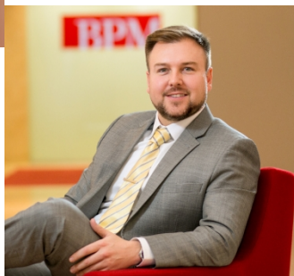
and Advisory Group Co-Leader